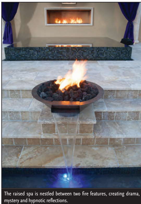
The raised spa is nestled between two fire features, creating drama, mystery and hypnotic reflections.

The interior is a mauve/black exposed aggregate surface from StoneScapes. In this case we included flecks of abalone that give