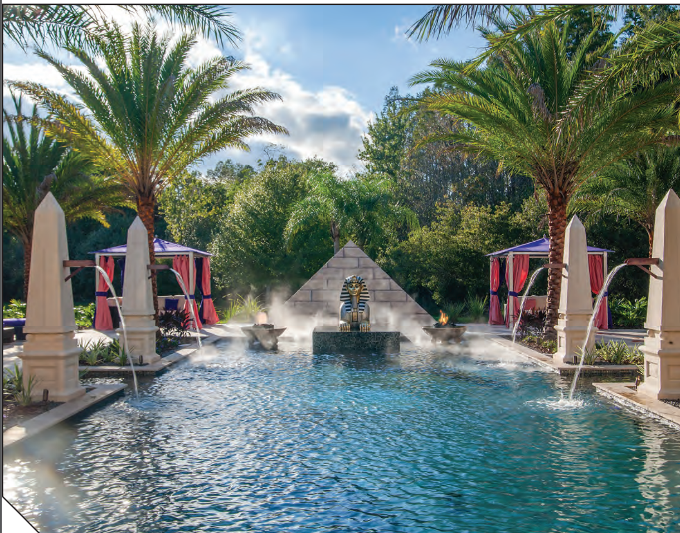
The design features plantings native to the Mediterranean, columns with spillways, and a color palette favored by Egyptian royalty.

a fire/water bowl feature in the front and one recessed linear fire feature in the wall behind the spa. Above the fire feature we have a tile mosaic of Isis overlooking the space.