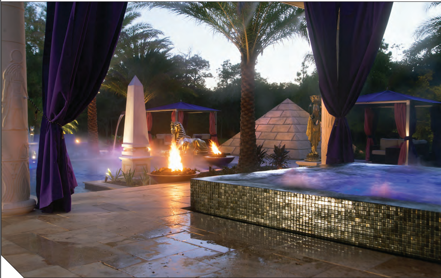
With its columns, curtains and raised perimeter overflow design, the spa area takes on the feeling of a palatial ancient Egyptian temple and will no doubt be featured in upcoming episodes of "Laps of Luxury."

the set for an upcoming reality show called "Laps of Luxury," which follows the exploits of the models living there. The site also functions as a venue for large V.I.P. events and as a set for photo shoots.