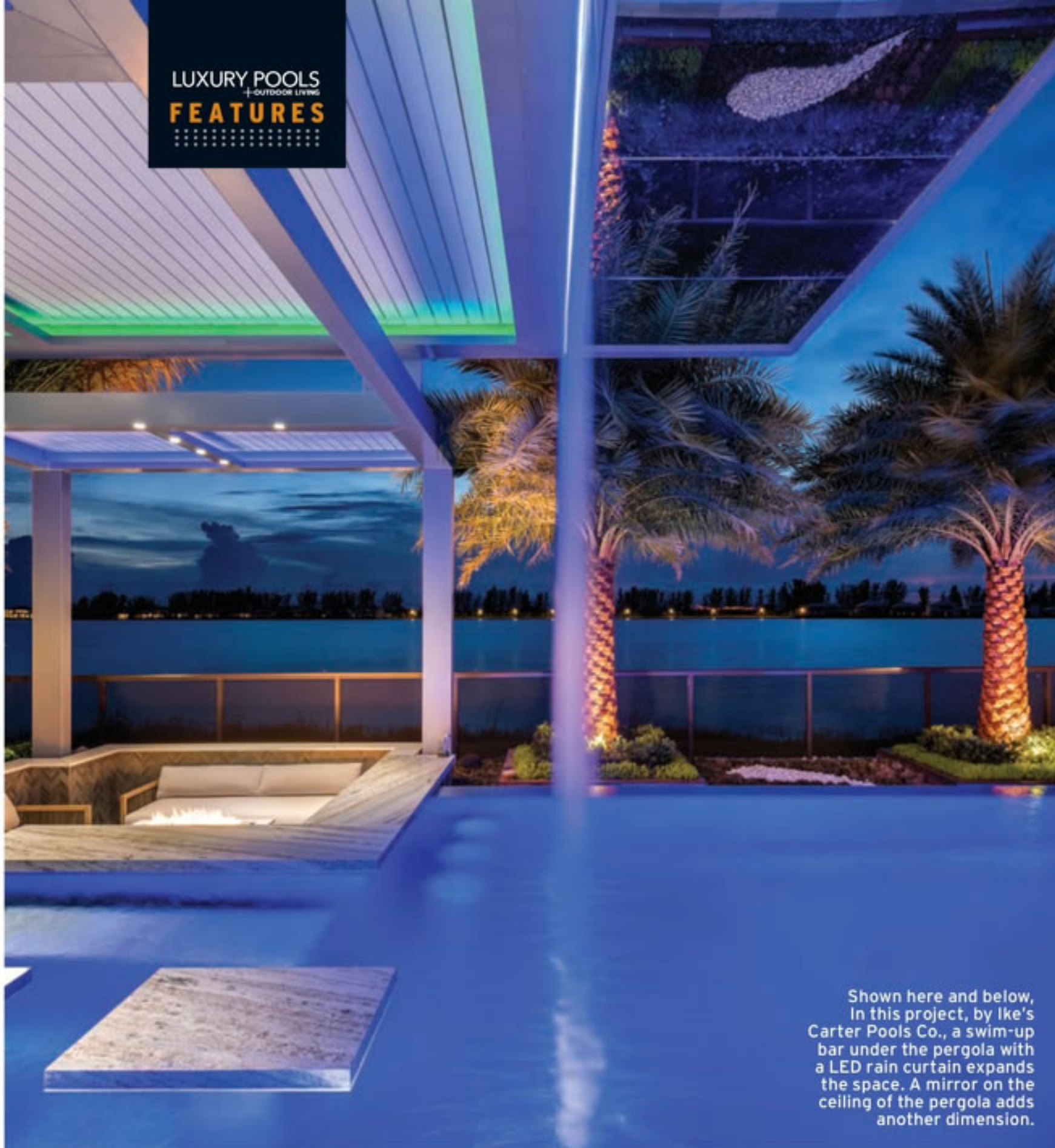
Shown here and below, in this project, by Ike's Carter Pools Co., a swim-up bar under the pergola with a LED rain curtain expands the space. A mirror on the ceiling of the pergola adds another dimension.