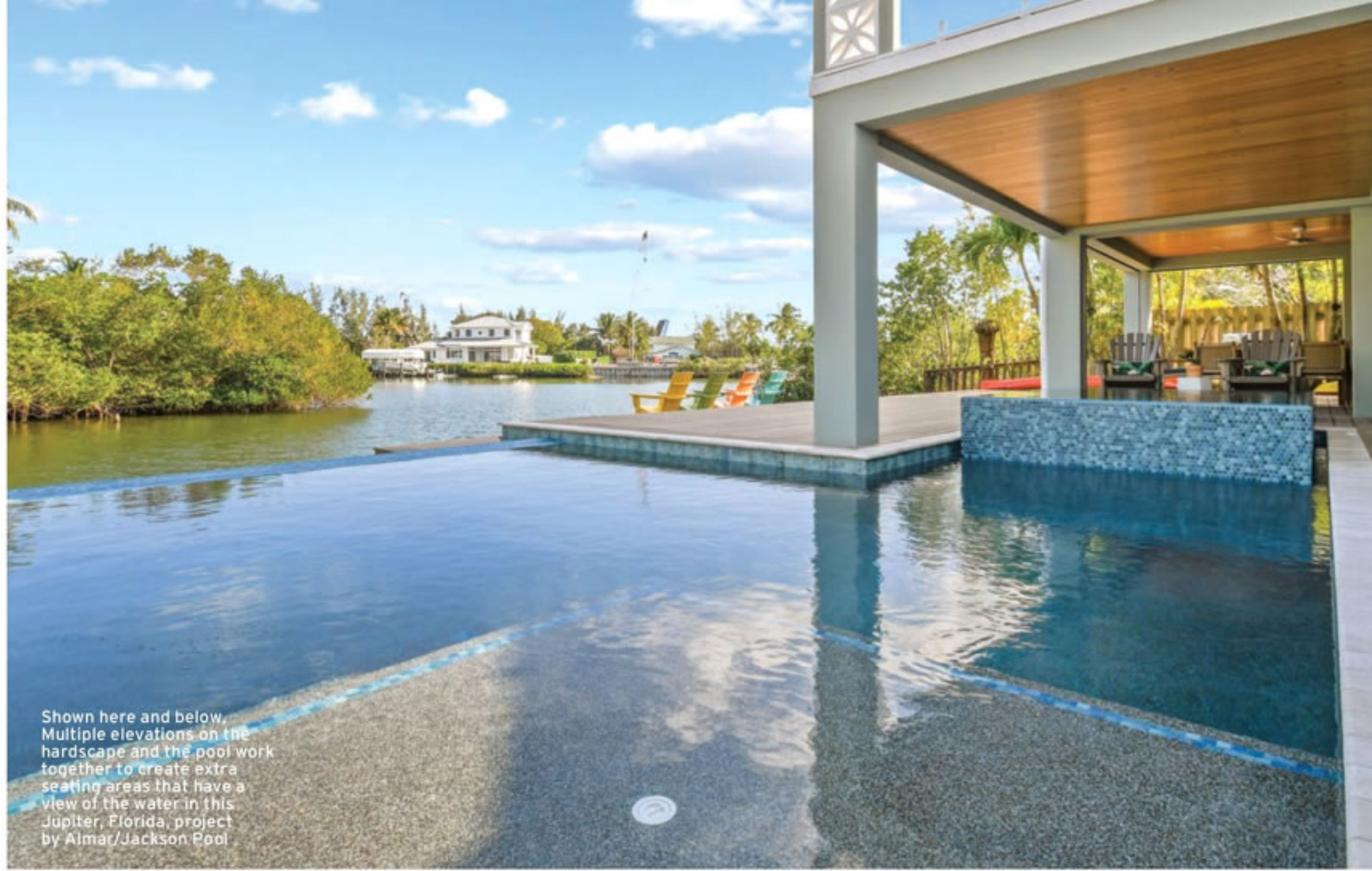
Shown here and below, Multiple elevations on the hardscape and the pool work together to create extra seating areas that have a view of the water in this Jupiter, Florida, project by Almar/Jackson Pool

In one recent South Florida project, for