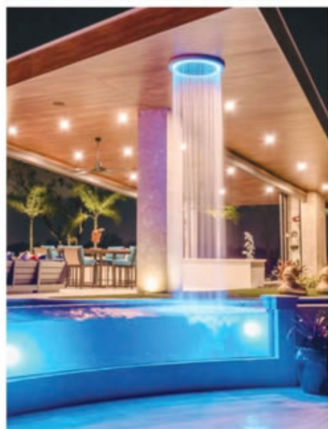
Top: Encompassing five bodies of water, a one of a kind Ryan Hughes Design Build project is aglow with lighting, a lazy river, water features, and a collection of outdoor living spaces crafted for enjoyment by all ages.