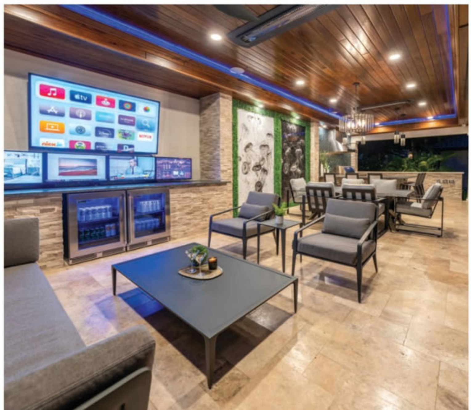
Top, In one of the projects by Ryan Hughes Design/Build, a column of illuminated water pours from a pavilion roof into a lazy river.