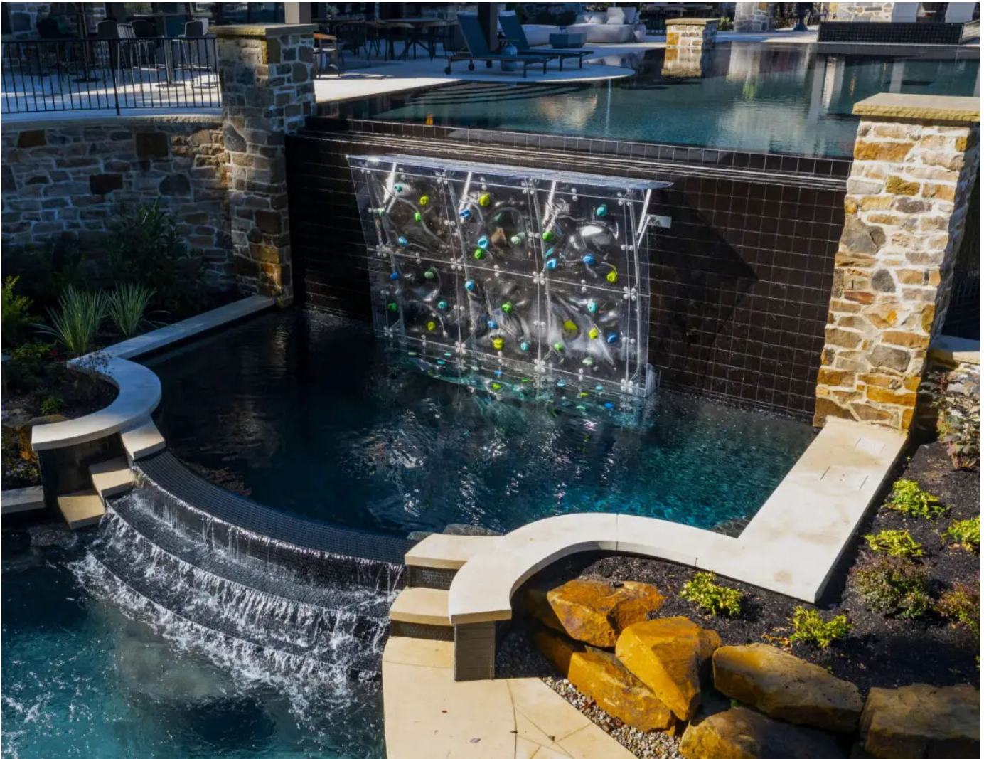
Above and below, photographs by Carson Becker, Hanson PhotoGraphic, and Carson Becker

Bespoke features such as vanishing edge spas, sunken fire pits, intimate grottos, or gathering pavilions, waterfalls, intra-pool windows and sun-lounging shelves create endless possibilities for poolscape.