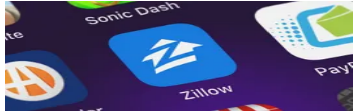
The 10 Strangest Homes on Zillow Gone Wild