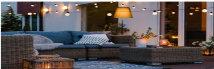
Add Luxury to Your Outdoor Space with These Furniture Accents