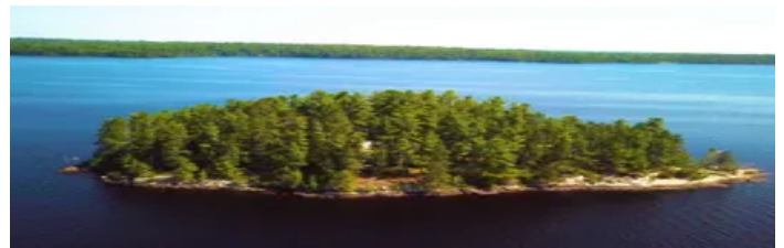
Private, Developed Island in a Lake on the US-Canadian Border Available for $640,000