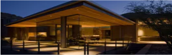
Secluded Contemporary Luxury in the Arizona Mountains Can Be Yours for $13.5M