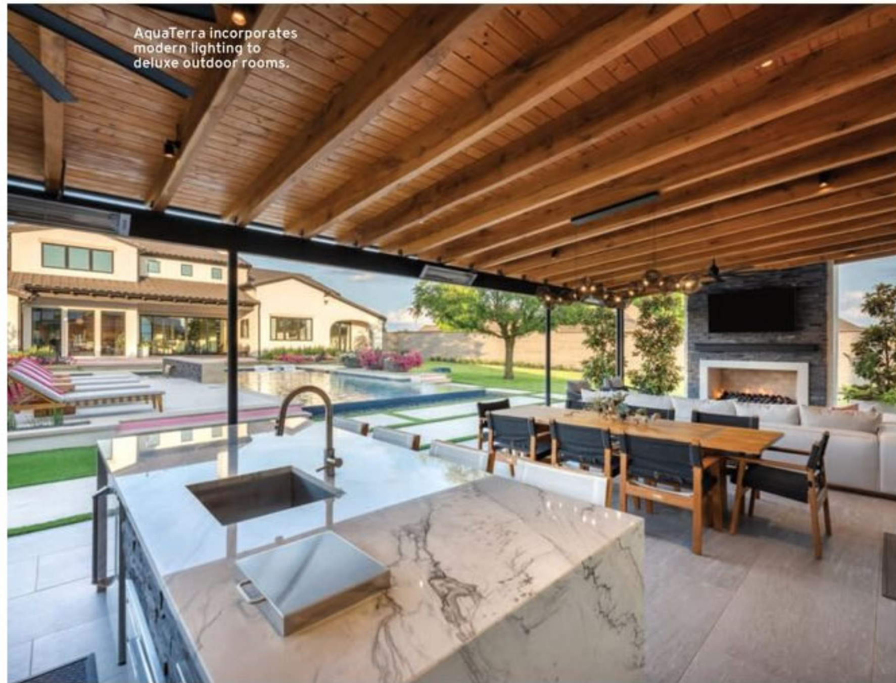
AquaTerra incorporates modern lighting to deluxe outdoor rooms.

anthonyssylvan.com , aquaterraoutdoors.com , akvospiralift.com , ryanhughesdesign.com , westmoddesign.com