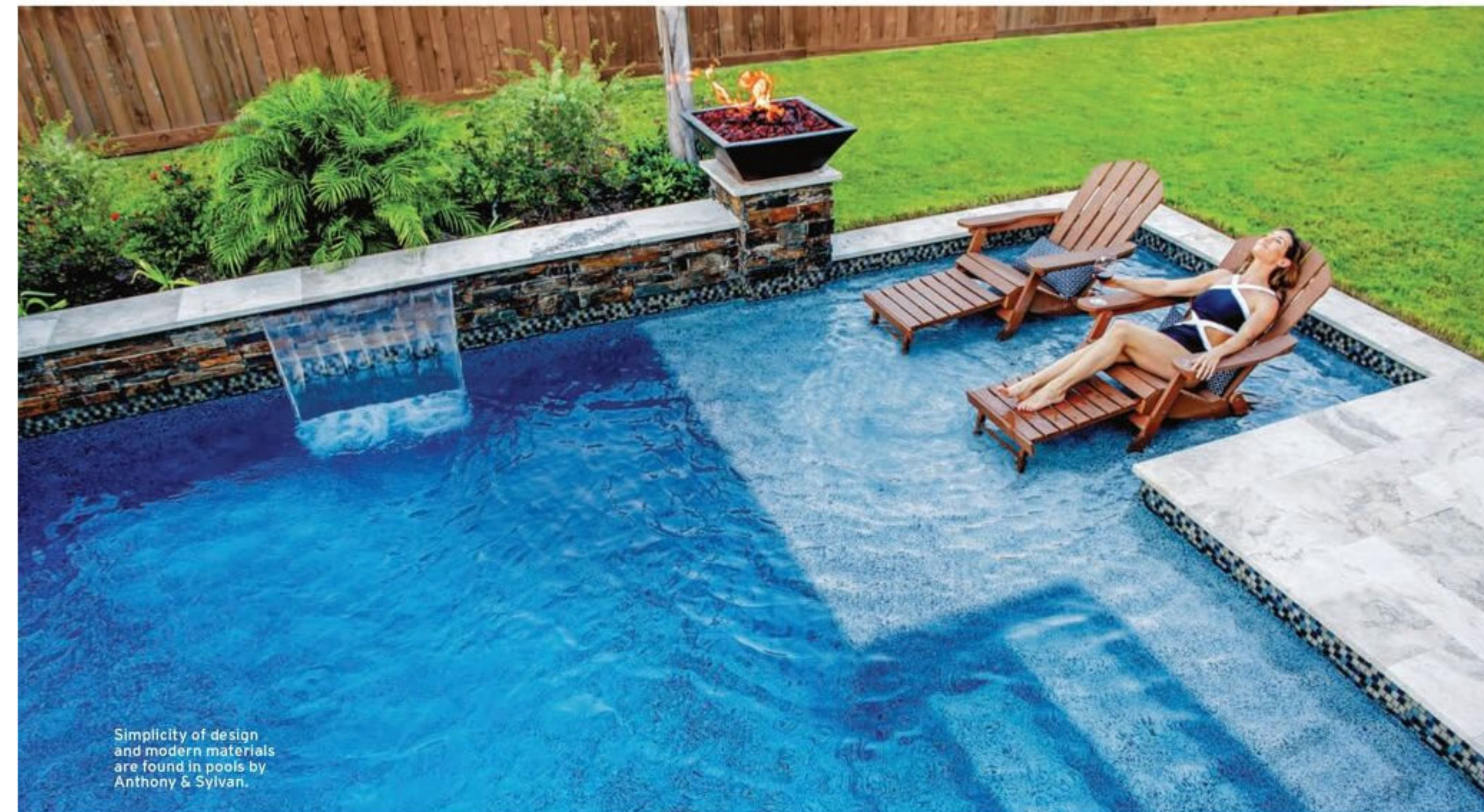
Simplicity of design and modern materials are found in pools by Anthony & Sylvan.