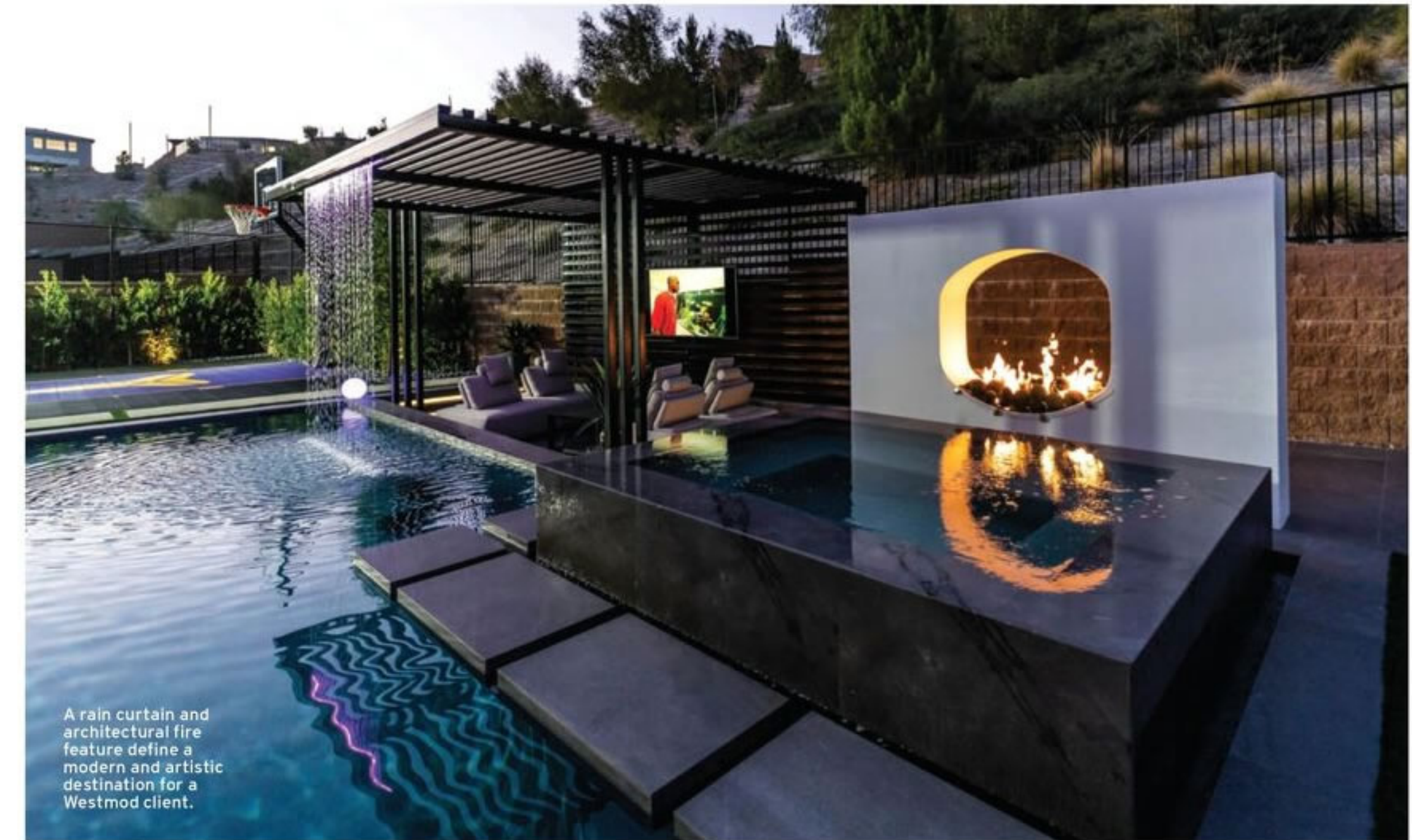
A rain curtain and architectural fire feature define a modern and artistic destination for a Westmod client.