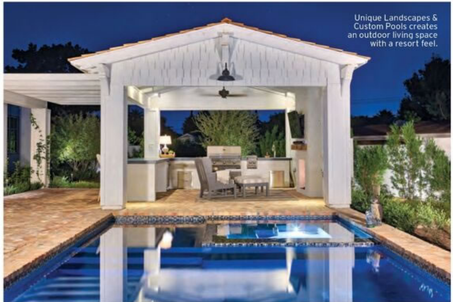
Unique Landscapes & Custom Pools creates an outdoor living space with a resort feel.

Collaboration is especially important since today’s homeowners, Griffin says, want integrated interiors and exteriors, such as sound systems and pool automation technology available indoors and out. He is seeing a design shift as well. “There is a huge migration away from curvilinear and freeform pools. Now 90 percent of our projects are