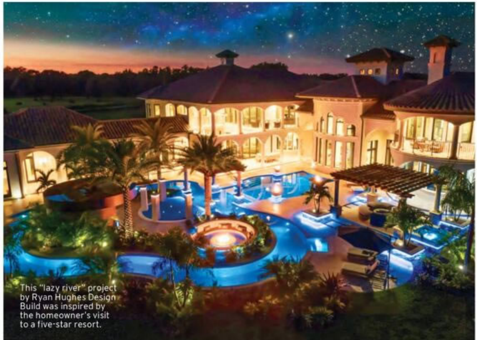
This “lazy river” project by Ryan Hughes Design Build was inspired by the homeowner’s visit to a five-star resort.