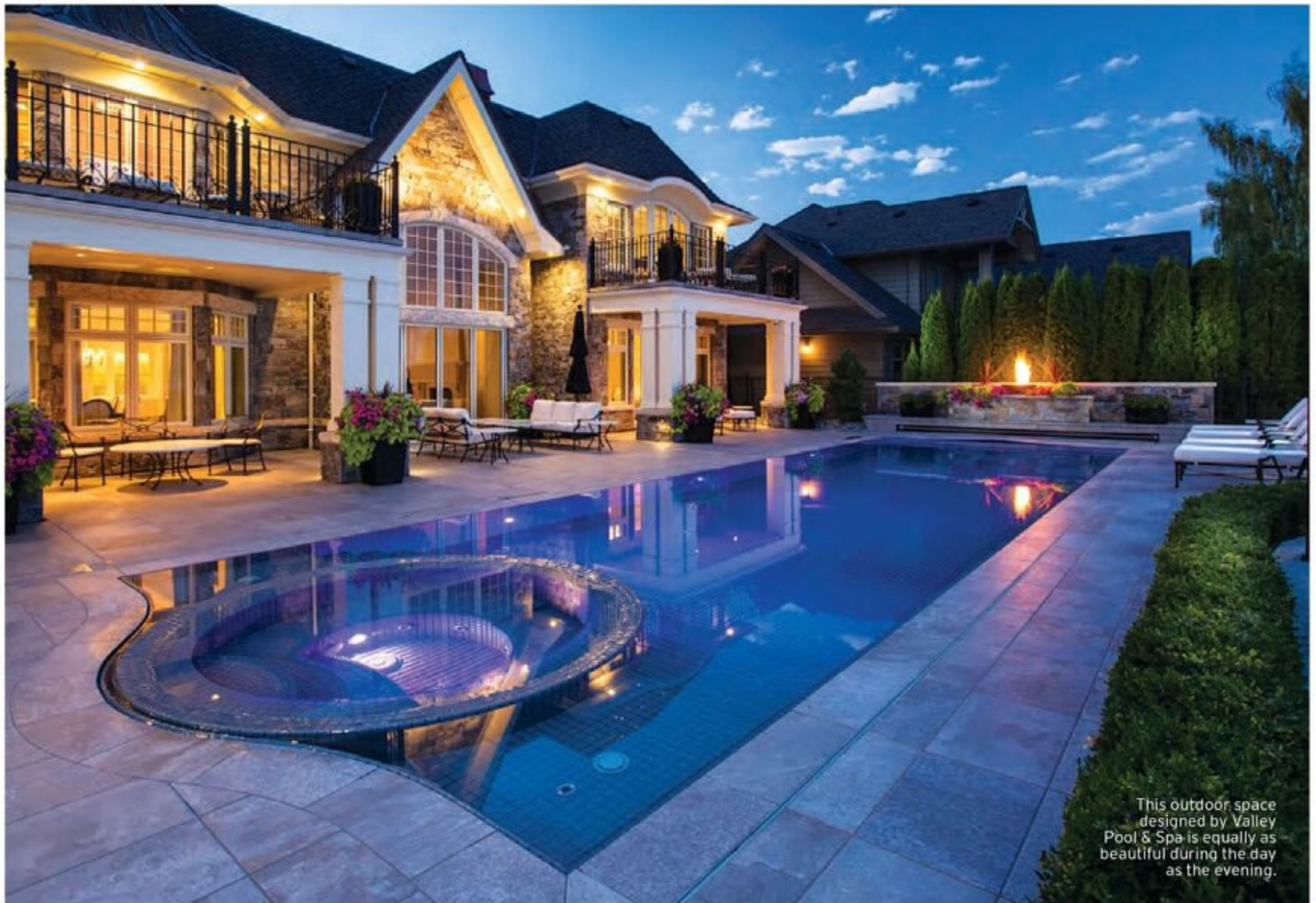
This outdoor space designed by Valley Pool & Spa is equally as beautiful during the day as the evening.

modern, geometric. People want unique architecture and classic pools. They want continuity.”