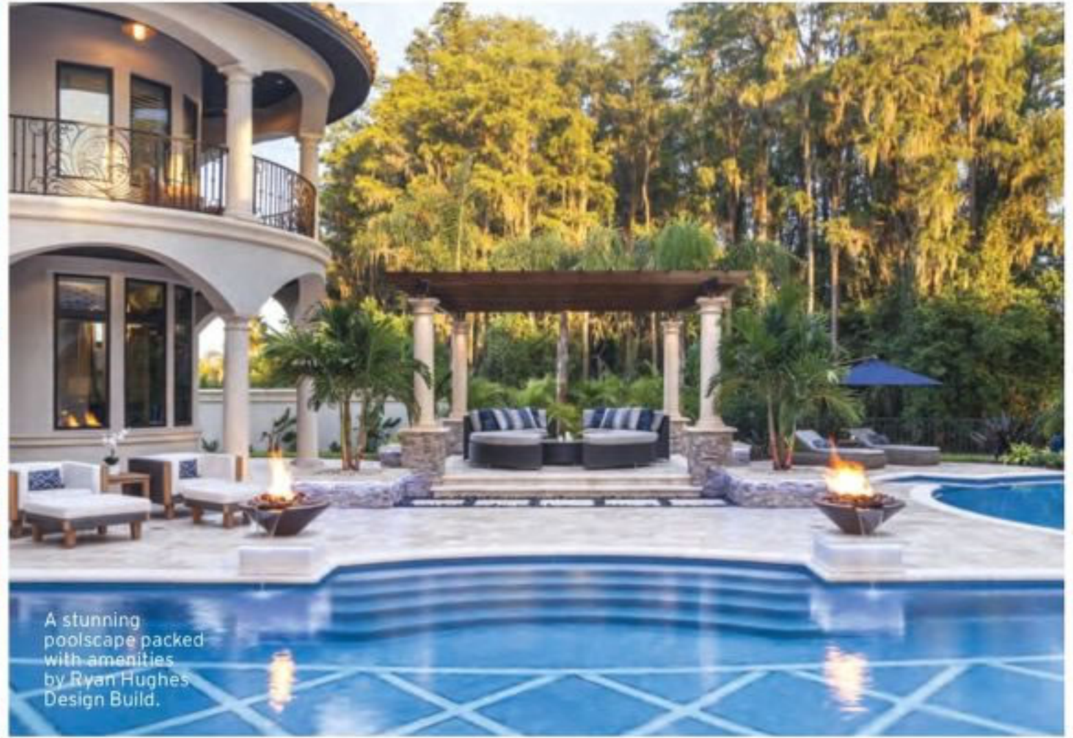
A stunning poolscape packed with amenities by Ryan Hughes Design Build.