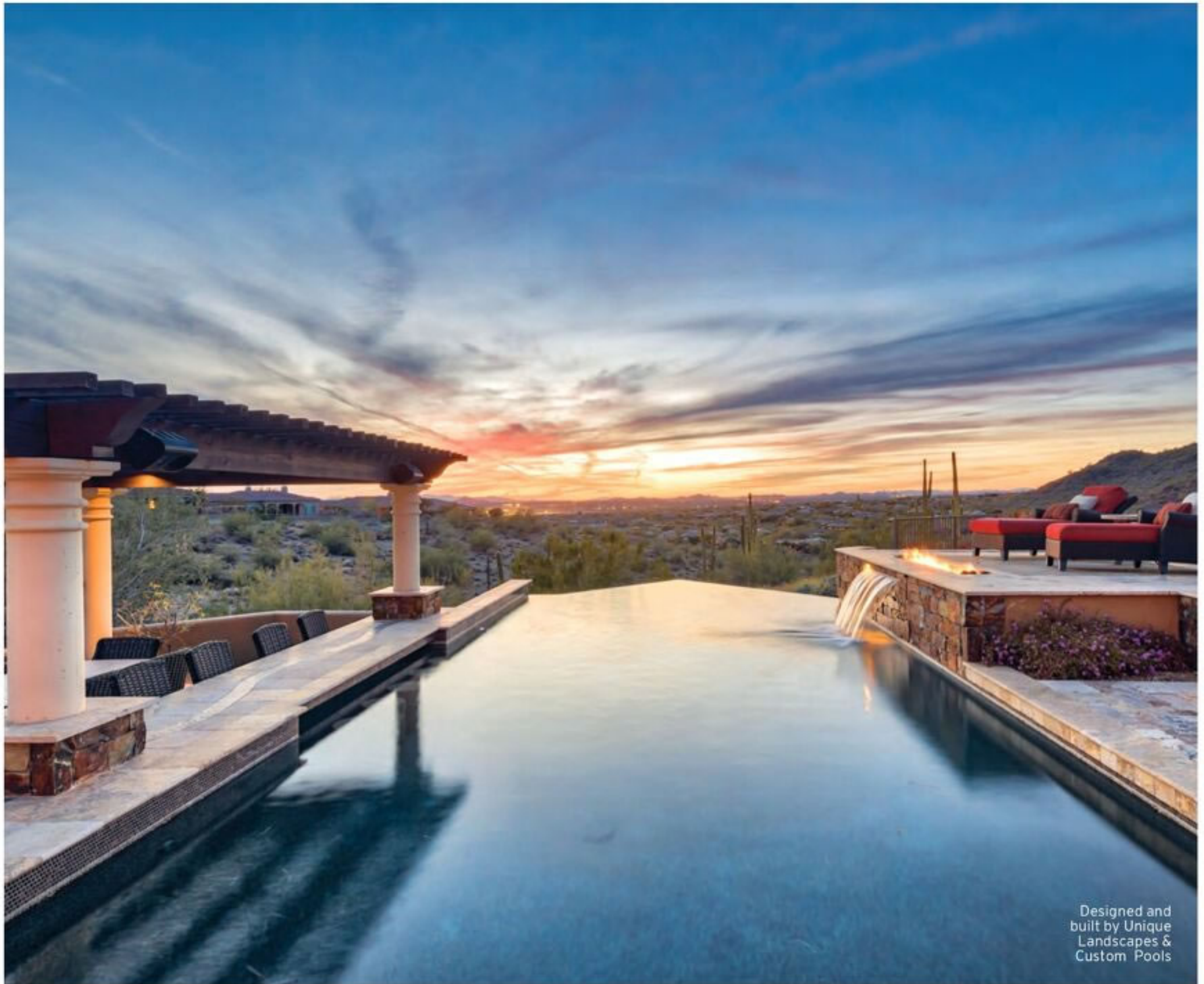
Designed and built by Unique Landscapes & Custom Pools