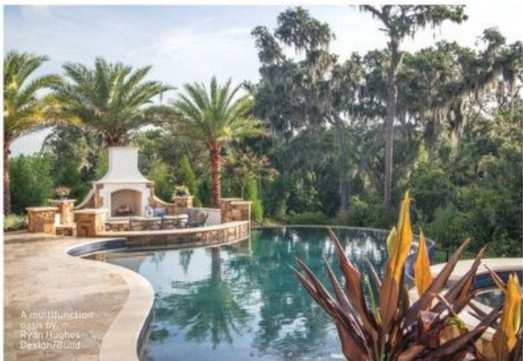
A multifunction oasis by Ryan Hughes Design/Build

The clients' wish list included a fireplace and seating area in a more traditional style, as well as a columned pergola over an outdoor kitchen with ambient and direct lighting. They also decided to include a decorative tile gas fire feature. Hughes incorporated curvilinear areas to bring in "a bit of true geometry," so the project wouldn't be amebic in shape. According to Hughes, the challenge was making linear and biomorphic styles work together. Because the home's backside is one straight line he felt he couldn't