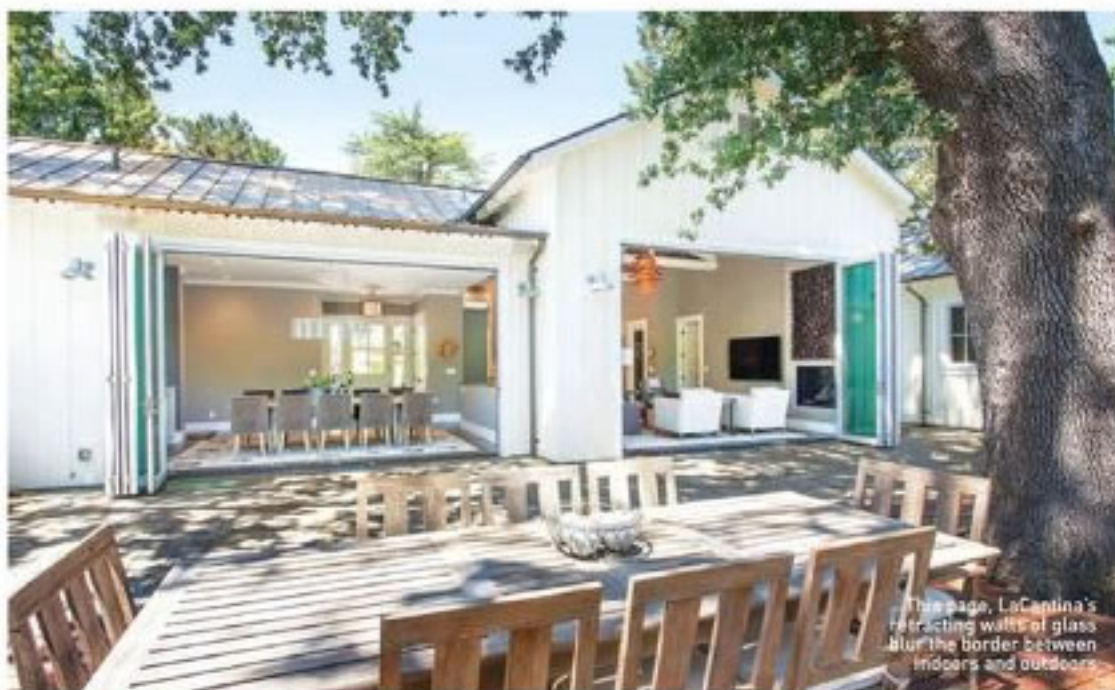
This page, LaCapina's retracting walls of glass blur the border between indoors and outdoors.

Because the home's interior is ornate and palatial with golf-leaf moldings, Hughes and his team accented 4,000 square feet of one pool's surface with intricate designs using inlaid mosaics and tiles covered in a thin, 24 carat gold foil, all of which measure no more than half an inch in size. And because the entire pool's inspiration was the soothing nature of water in motion, he implemented a deceptively powerful hydraulic system. "It looks like it is gently moving over surfaces all working in one direction," Hughes says. "The appearance of still and slow-moving water is deceiving, as a closer look at the hydraulics plan shows six pumps moving the water at an enormous speed."