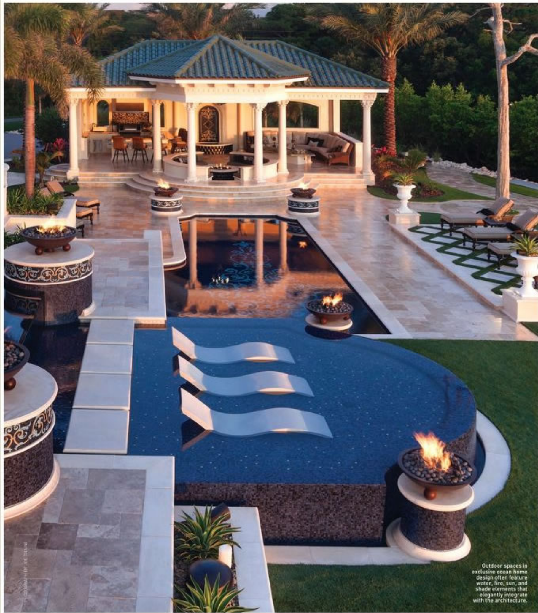
Outdoor spaces in exclusive ocean home design often feature water, fire, sun, and shade elements that elegantly integrate with the architecture.